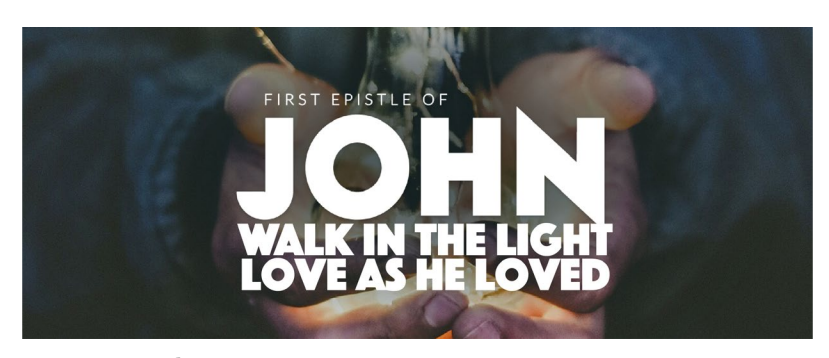
February 24, 2019